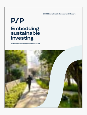
2023 Embedding sustainable investing