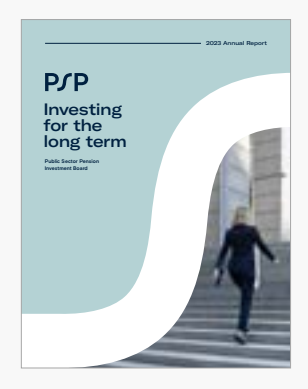
2023 Annual Report