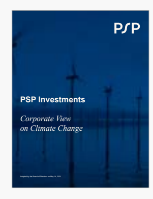
PSP Corporate View on Climate Change