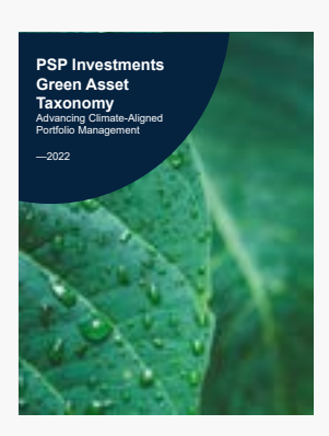
PSP Green Asset Taxonomy