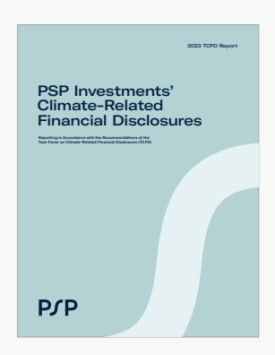
2023 PSP Investments' Climate-Related Financial Disclosures