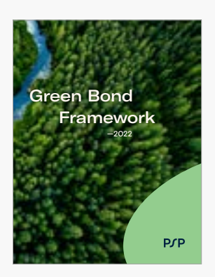
PSP Green Bond Framework