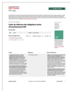
PSP Green Bond Second Opinion – S&P Global Ratings – Shades of Green