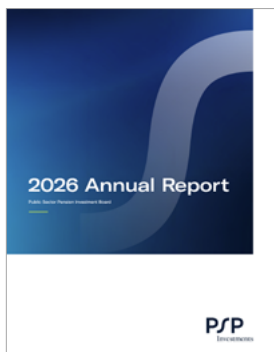
2026 Annual Report (including Climate-Related Financial Disclosures)