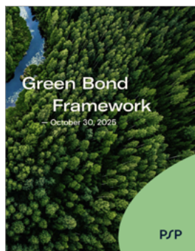
PSP Green Bond Framework